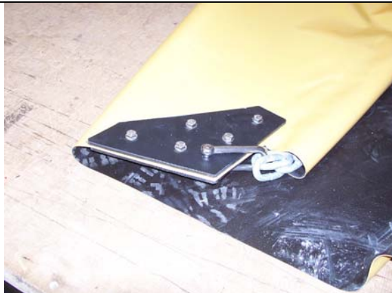
10mm Ballast chain secured to 6mm HDPE end plates using M10 316 long D shackles