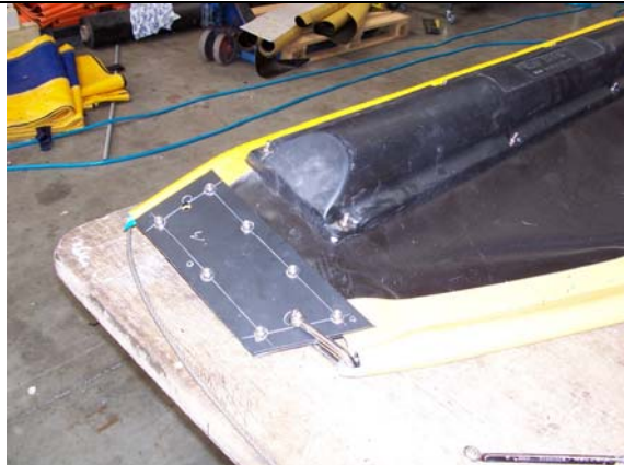
End plates 6mm HDPE sheet bolted to skirt with M8x25mm 316 SS