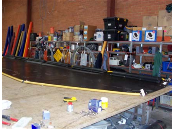
Length of Baffle 7m: Contour 0 to 2m over first 3m & 1 to 2m over end 2m

Client: Berrigan Shire Council for client installation Membrane: Sioen B6000 Potable Water Coated PVC Units: 4 Identical units provided for client installation