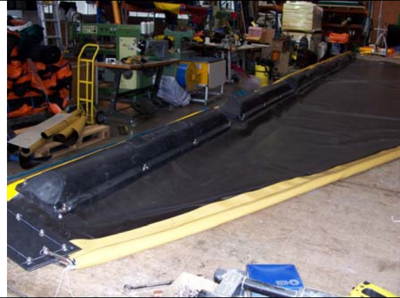
Floats AB&BCo HDPE rotationally moulded bolt on float bars